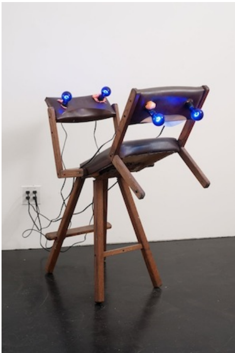
Jonathan Pylypchuk, Isn't It Amazing Baby, We're in Hollywood , 2011, mixed media

The named space is a space of lack. These figures find recourse only in abjection, accepting that they are cast-offs, crusty wanderers, shitty, without fixed identity. Further, each sculpture's individual title, a plaintive, fucked-up non-explanation, is as much a part of the works as their fugitive screws and sludgy foam.