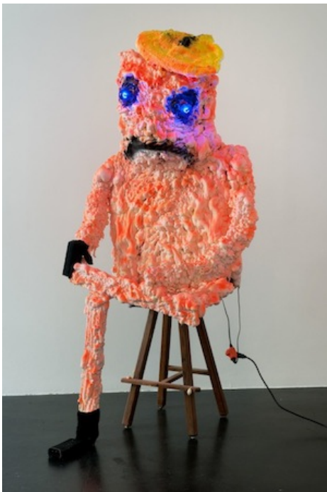
Jonathan Pylypchuk, Welcome To The Second Half of the Rest of Your Life , 2011, mixed media

A pleasure of overlapping lines, a crude but elegant sculpture, a thrift store find taken apart and ably put back together with not much more than twenty screws. Get it? They're screwed, together. It's Hollywood, and they're both screwed! Further, notice that semantically: stool = chair and stool = shit... Fucking shit!—a joke on anal sex and an exclamation. (Why does art criticism sometimes feel like you're trying to explain a good joke?)