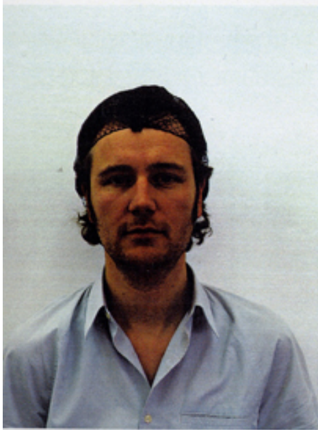
ntitled (Mug Shot #3) 2002 C-type print 130x100 cm