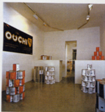
• Ouchi 2002. Installation view