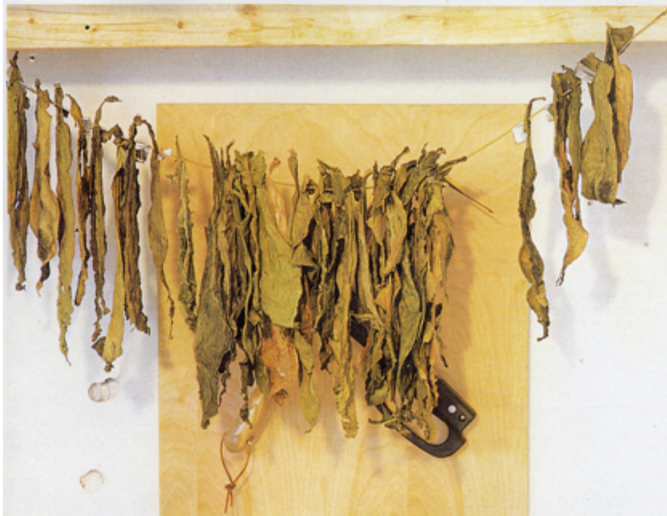
urb Servin (detail) 2002 Mixed media Installation view

Ready to run, ready to sell. But sell what? Drugs? Contraband? Or art? Picture Daniel Buren selling rock instead of painting stripes.