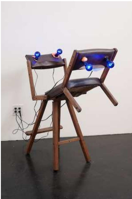
Jonathan Pylypchuk, Isn't It Amazing Baby, We're in Hollywood , 2011, mixed media

The named space is a space of lack. These figures find recourse only in abjection, accepting that they are cast-offs, crusty wanderers, shitty, without fixed identity. Further, each sculpture's individual title, a plaintive, fucked-up non-explanation, is as much a part of the works as their fugitive screws and sludgy foam.