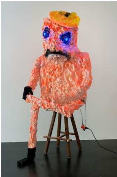
Jonathan Pylypchuk, Welcome To The Second Half of the Rest of Your Life , 2011, mixed media

A pleasure of overlapping lines, a crude but elegant sculpture, a thrift store find taken apart and ably put back together with not much more than twenty screws. Get it? They're screwed, together. It's Hollywood, and they're both screwed! Further, notice that semantically: stool = chair and stool = shit... Fucking shit!—a joke on anal sex and an exclamation. (Why does art criticism sometimes feel like you're trying to explain a good joke?)